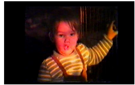
Figure 1. Example of clowning. Extreme facial expression (imitation of great grandmother’s face while snoring) repeated following others’ laughter.

Although infants in the first year of life do not have complex cognitive