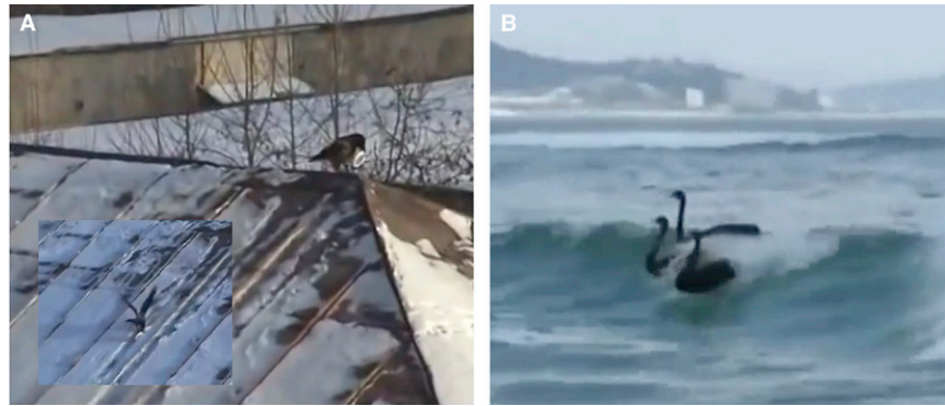
Figure 1. Screenshots from YouTube videos of birds appearing to have fun. (A) A crow slides down a snowy rooftop in Russia. (B) A flock of swans ride the crest of a wave, appearing to 'surf'.

How may fun be represented in the brain? At first, this seems a daunting question, yet although fun is a relatively new concept with respect to neuroscience and comparative cognition, there is precedence in its study. Fun involves doing something rewarding — it elicits a tendency to repeatedly approach a reward-inducing stimulus ( wanting ) — and it provides a sense of pleasure — a hedonic response eliciting a positive affective feeling ( liking ). We know